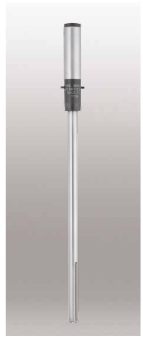
Honing tool L series