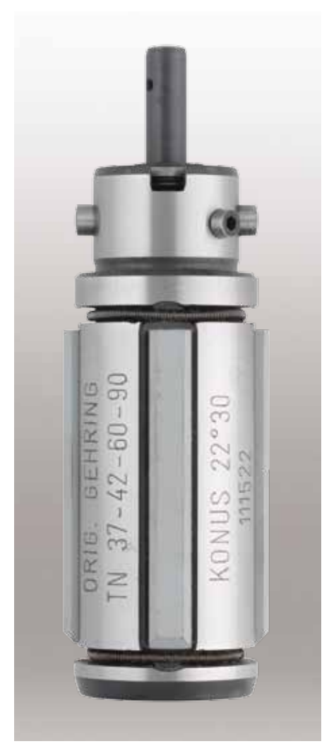
TN honing tool